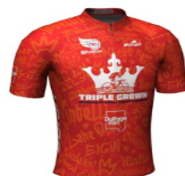
Triple Crown Daily Winner