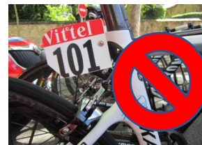
WRONG - BREAKS OFF!

ACC Timing Chips: The Pro-1 Men and Pro-1-2 Women will be issued timing chips for the Lake Bluff ACC race. Chips must be securely attached to the front fork of the bicycle. Timing chips are to be returned to the Ignite Your Event timing trailer immediately after the event. A fee of $100 per unreturned timing chip will be assessed. The fee may be deducted from any prize winnings.