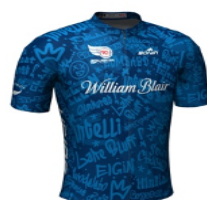
Master 40+ Daily Winner