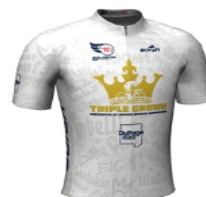
Triple Crown Omnium Winner