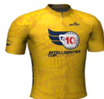
Intelli Omnium Leader

Categories: Men 2, Women 2/3, Men 3, Master 40+, Master 50+. On July 23 (Glen Ellyn) and July 24 (Winfield), points leader will receive the red DuPage Triple Crown Borah leader's jersey. On July 26 (Lombard), the omnium winner in each of the five race categories will receive the gold and white DuPage Triple Crown jersey.