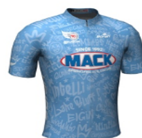
50+ and 60+ Daily Winner